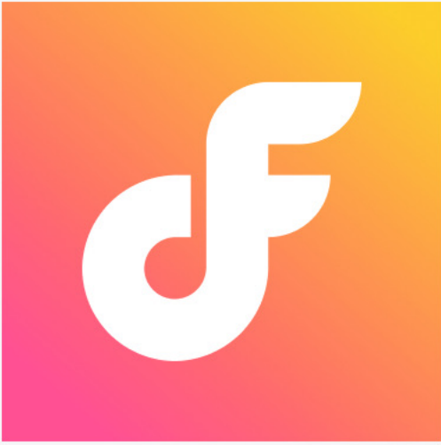
Square Social Icon