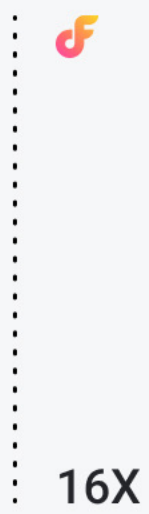
Logo minimum size