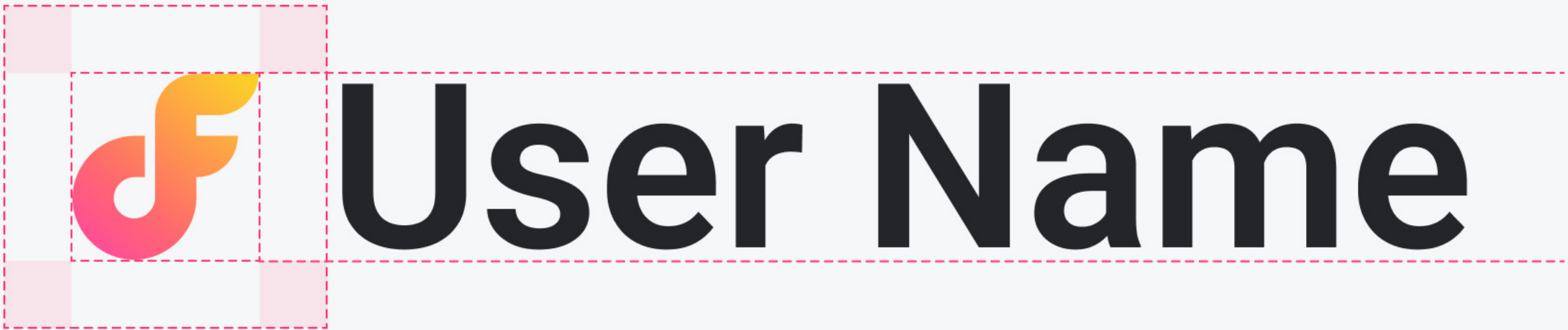
Logo clear space

The primary reason we use the logo pairing lockup is to indicate that an account is on dFans. When pairing a name or username the dFans logo, make sure our logo is in brand color or white. Observe our clear space rules, and scale the text to 100% of the height of the logo. Feel free to use a typeface that's from your brand's design system.