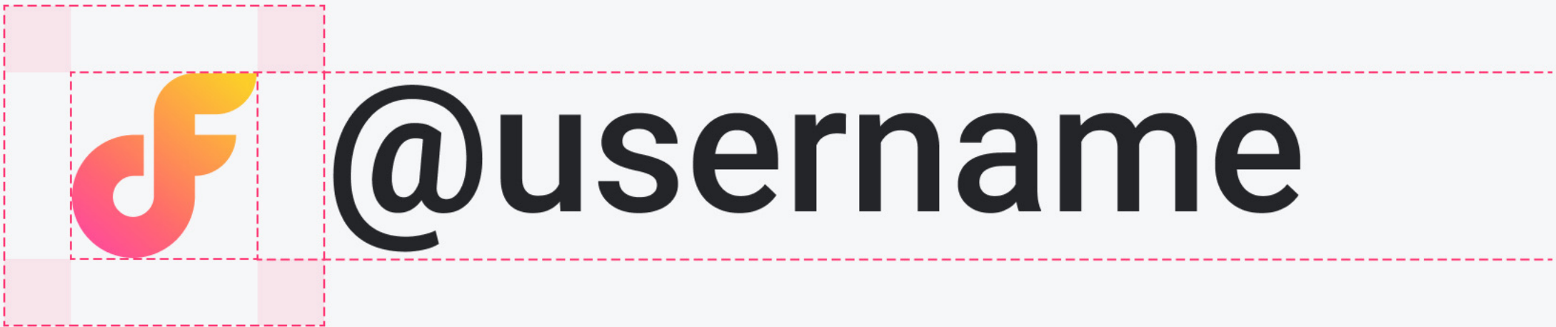
Logo clear space