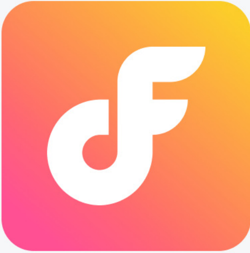
Rounded Square Social Icon